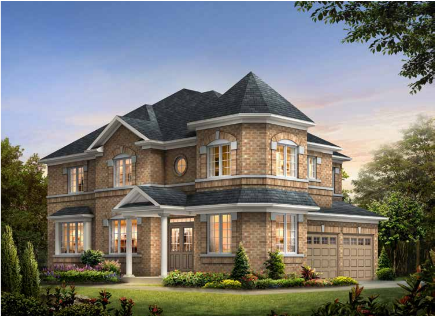
ELEVATION A 2,305 SQ.FT.